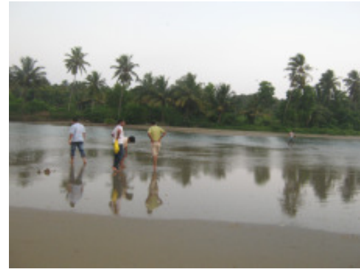
The sand deposit in Paravoor Lake is widening day by day. Though it is a threat to the lake it has an unexplored tourism potential and the local people can find it as an alternate livelihood

HELP Foundation is working with the Panchayat and District Tourism Promotion Council (DTPC) Kollam so that the Entire Fishing Community or the traditional inhabitants are being part of the hosting community by contributing their function as being part of a micro enterprise or SHG. Traditional Activity of the Fishing Community are recreated or done leisurely together with the tourists as they want, like fishing or an adventure trip in a Catamaran, Preparation of Local Cuisine & other traditional Fishing Village chores. The villagers are responsible for the well being of the visitors in terms of protecting them as well as guiding them in all aspects in their hamlet. Once they get accustomed with the visitors they can maintain the place lively and attractive.