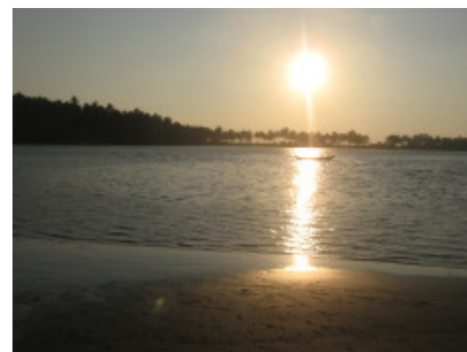
View from the island of sand deposit near the natural estuary